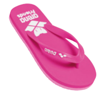
104 freak rose