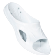
501 light grey