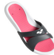
104 white-dark grey-magenta