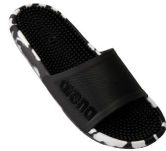
100 arena black