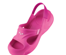
088 fuchsia-bright pink