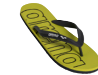
305 soft green-asphalt