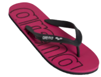
307 freak rose-asphalt