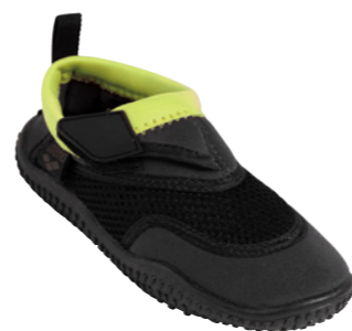
100 dark grey-lime