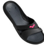
102 black-dark grey-black