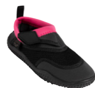
200 dark grey-pink