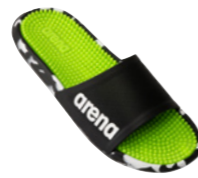
101 arena lime