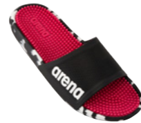
103 arena pink