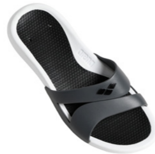
101 white-dark grey-black