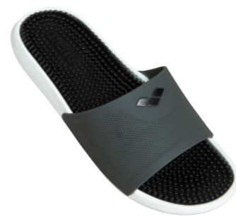
101 dark grey-black-white