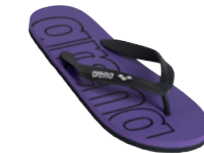
306 dark lavanda-asphalt