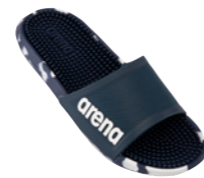
102 arena blue